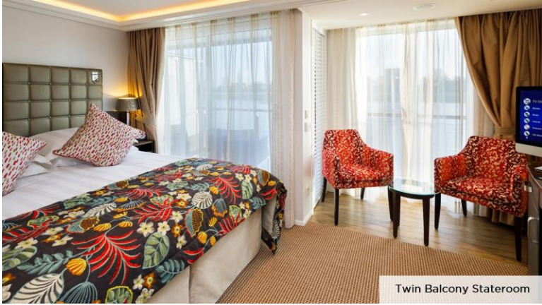
Twin Balcony Stateroom

7-night cruise | April 3-10, 2025 | Aboard AmaKristina